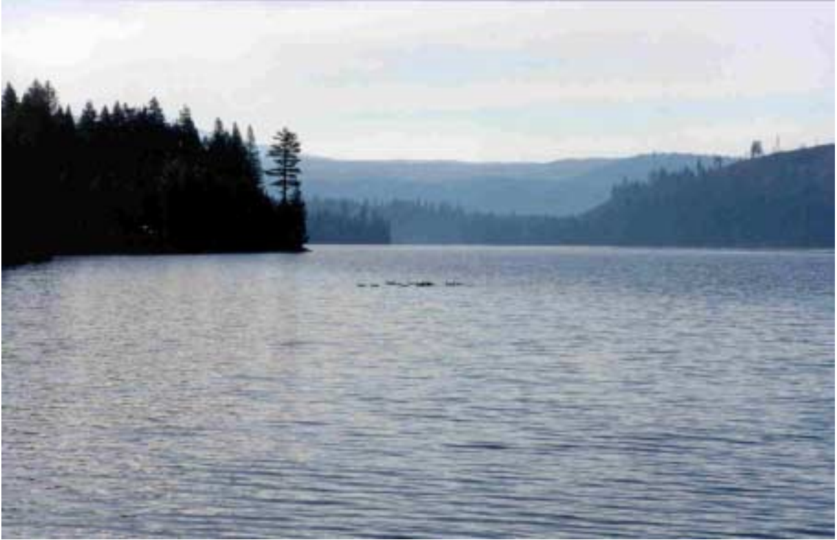
Union Valley Reservoir