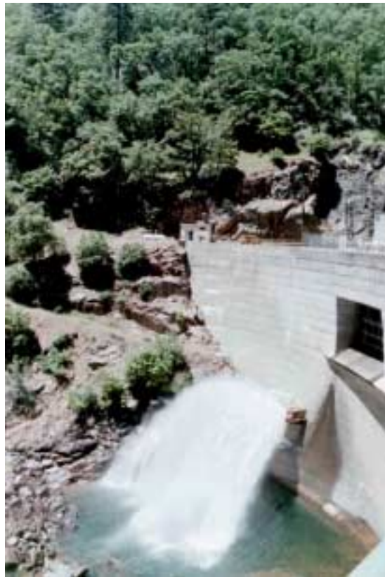
Camino Dam and Flow Release into Silver Creek