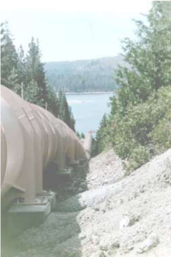
Robbs Penstock to Union Valley Reservoir