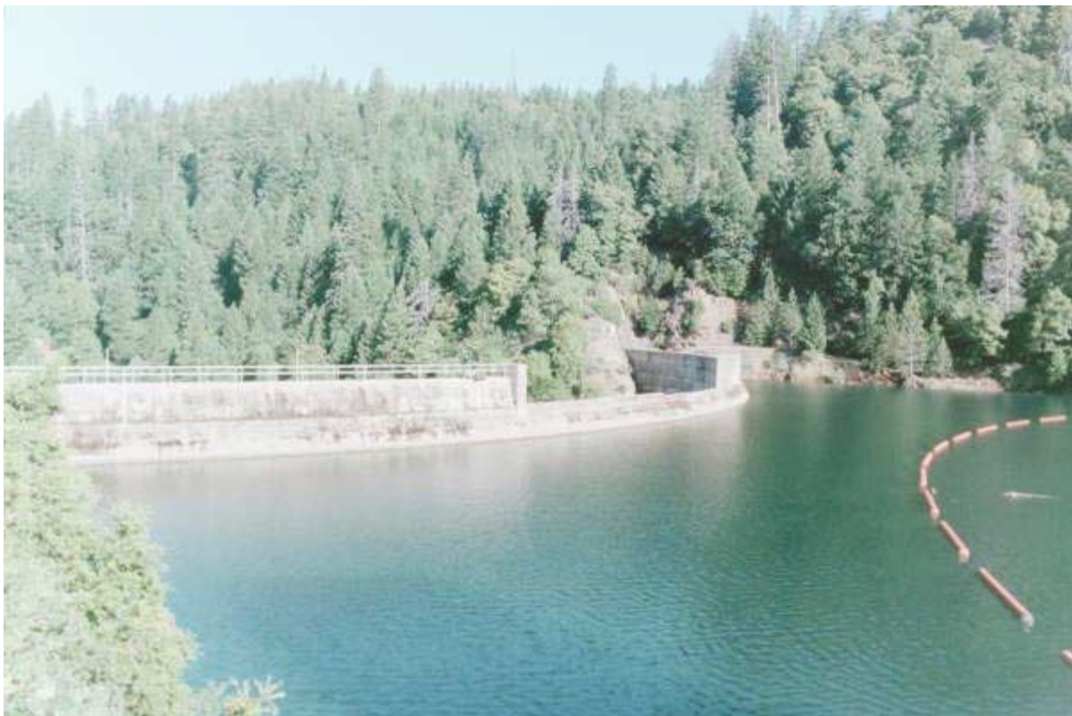
Brush Creek Reservoir and Dam