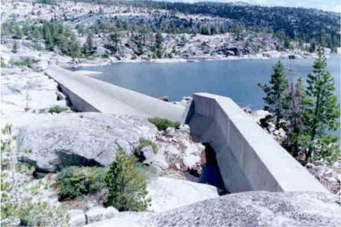
Rubicon Dam and Reservoir