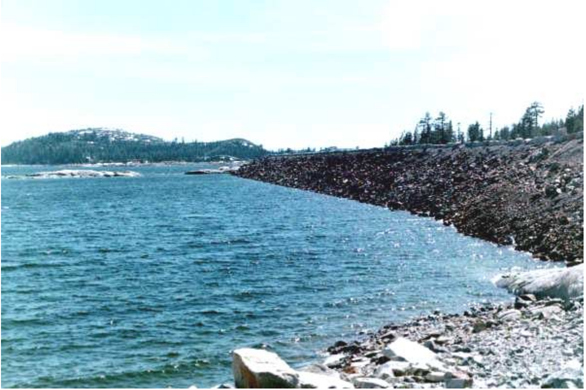
Loon Lake Reservoir and Dam