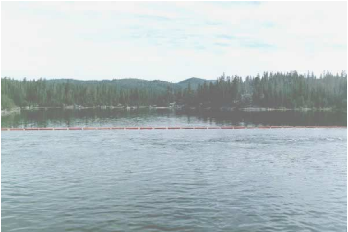
Gerle Creek Reservoir