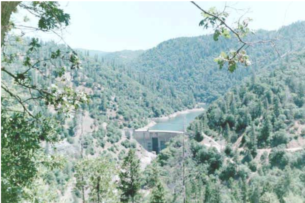
Slab Creek Reservoir and Dam