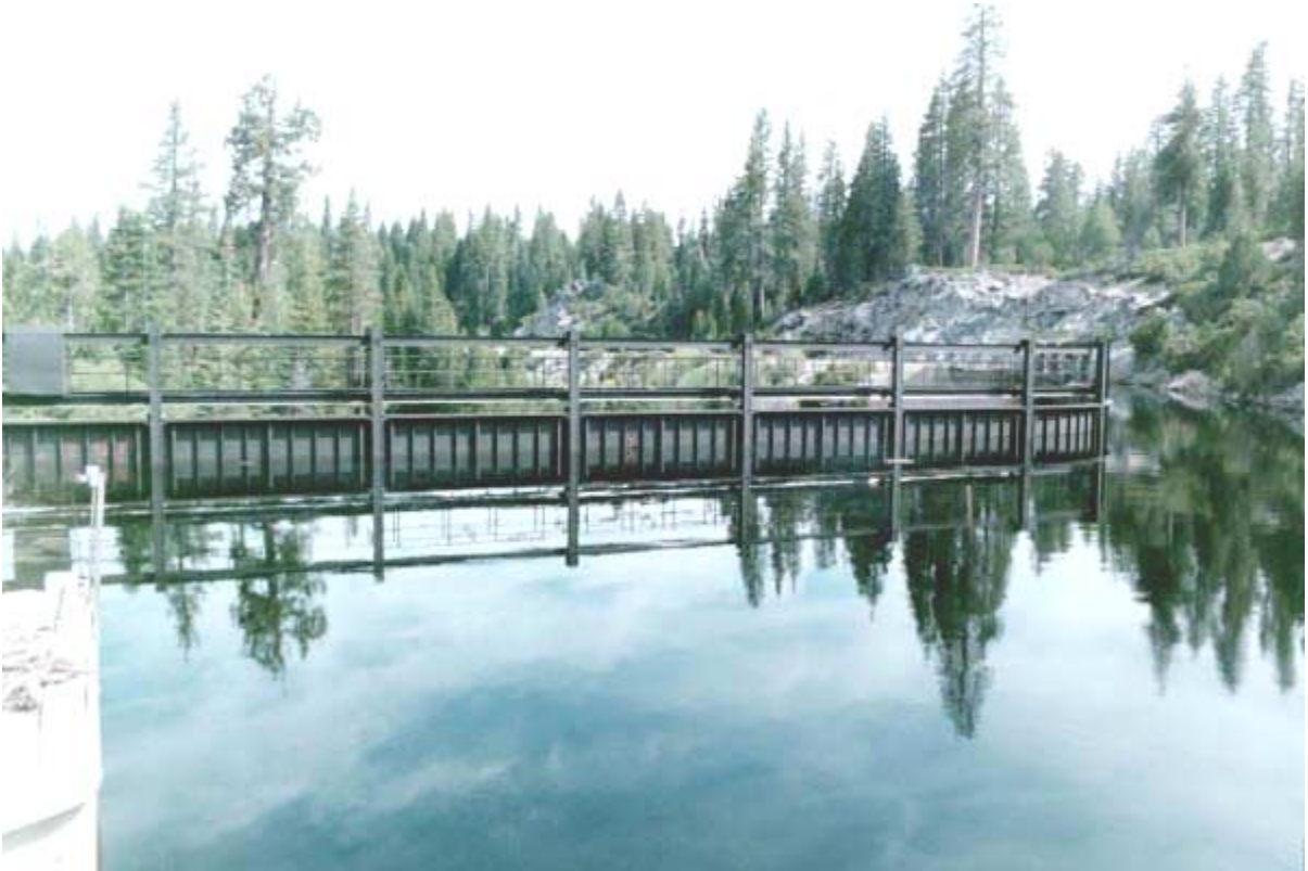
Robbs Peak Forebay