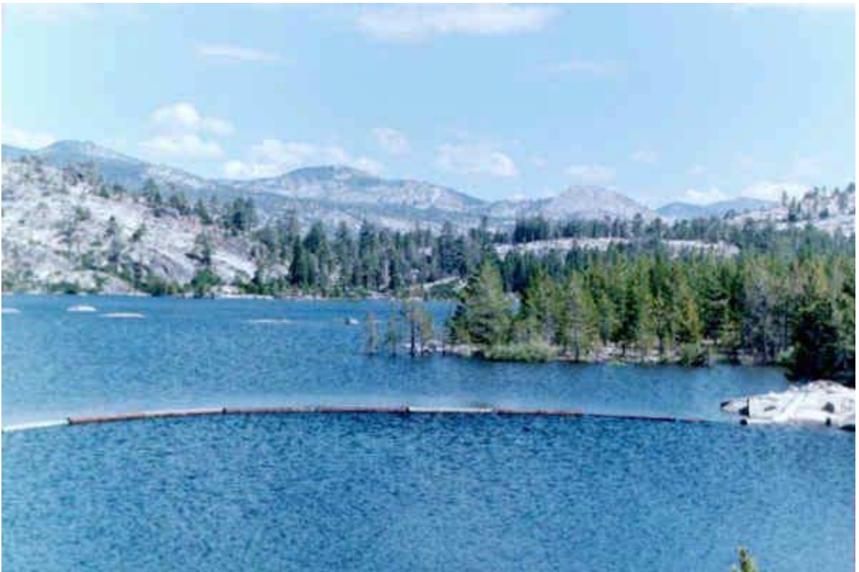
Buck Island Reservoir