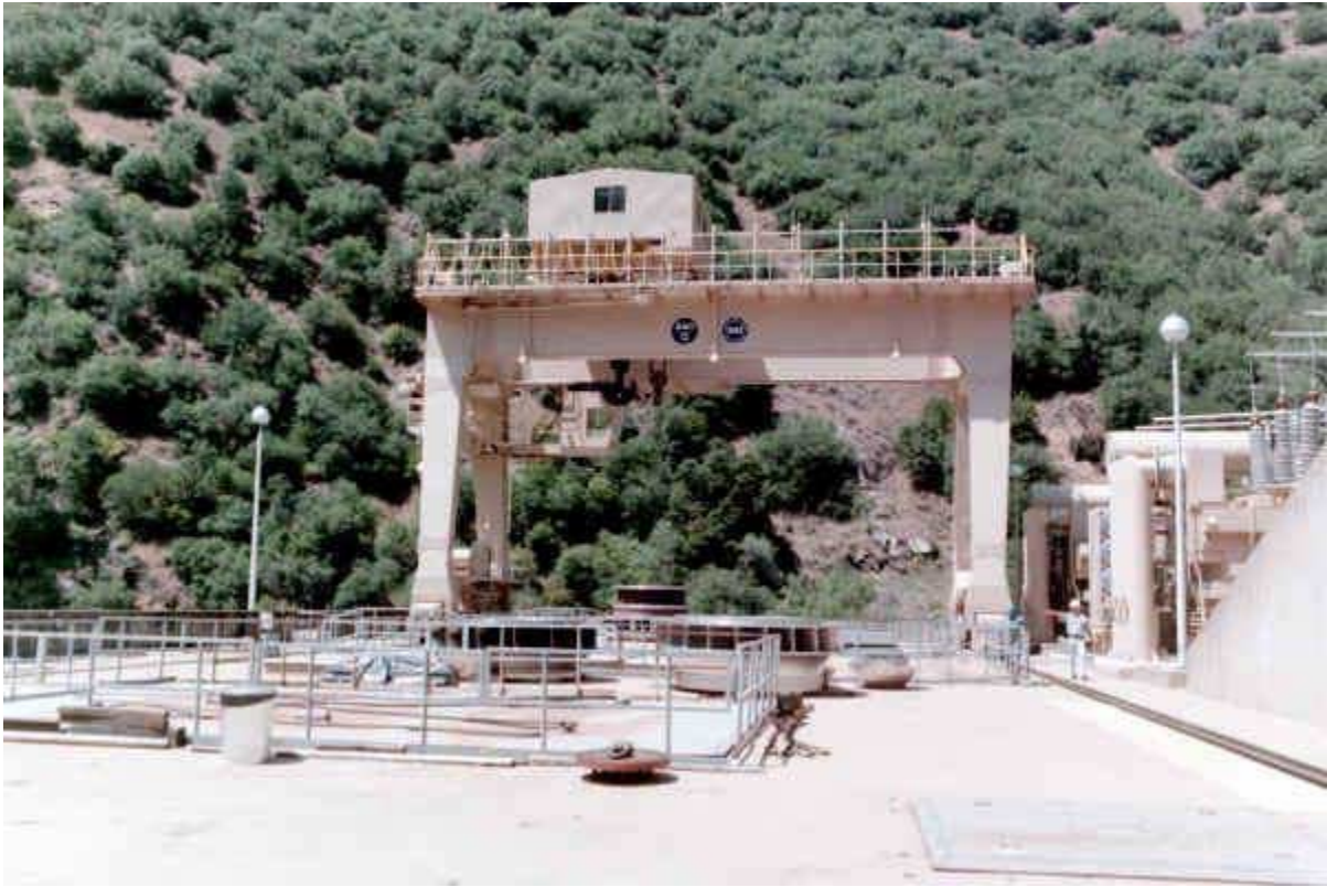
White Rock Powerhouse and Overhead Crane