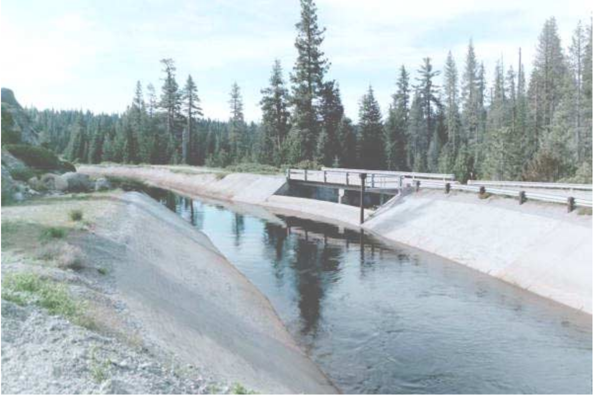
Gerle Creek Canal, en route to Robbs Forebay