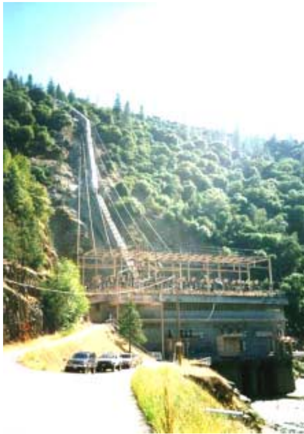
Camino Penstock, Powerhouse and Switchyard