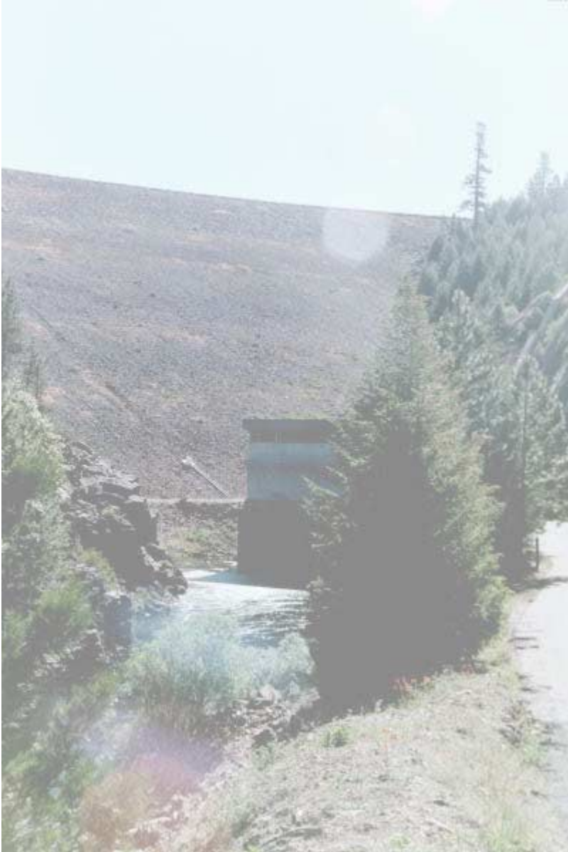
Union Valley Dam and Powerhouse